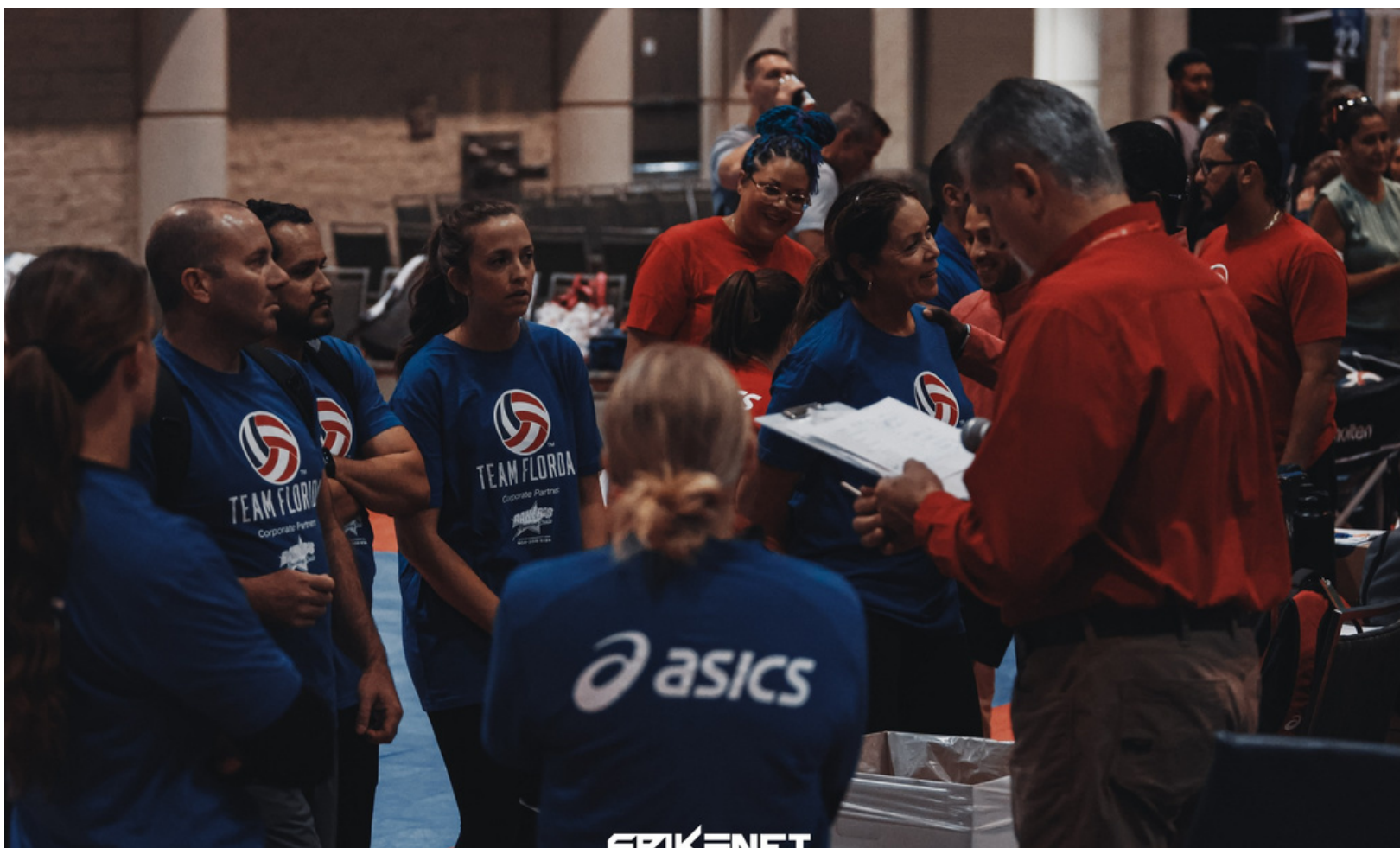
2023 Team Florida Girls Selection Camp at the Orange County Convention Center, Orlando, FL