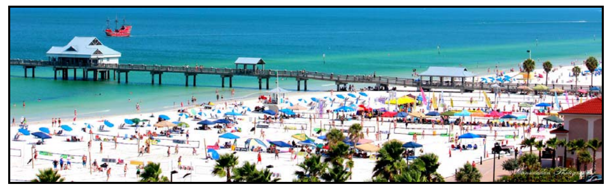
The first beach event of the season in Clearwater Beach on May 11-12 hosted a record 313 teams on 36 courts! Register online early to make sure you secure a spot at the next event!

The Florida Dig the Beach tour stops in 2013 will take place in 5 of the most desirable beaches in Florida: